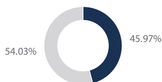
Top 10 Holdings as % of Total

Top 10 holdings as a percentage of Total Net Assets. Portfolio Holdings are subject to change at any time. References to specific bonds should not be construed as a recommendation to buy or sell and should not be assumed profitable.